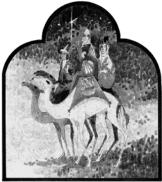
Magi from the east arrived