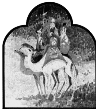
Unos sabios llegaron de oriente